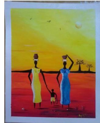
"Returning Home" 30x18