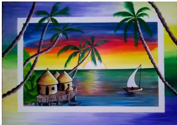
"Paradise in Africa" 30x20 acrylics on canvas