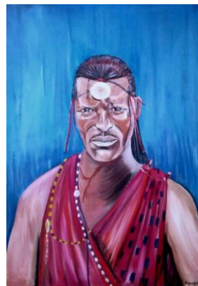
"Masai Warrior" 30x19