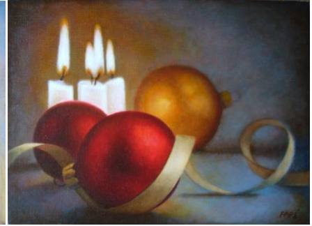
"Christmas Baubles" 9x12 oil on canvas