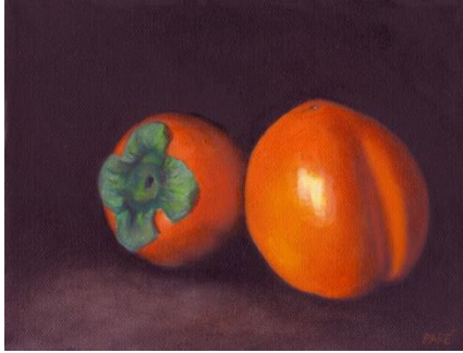
"Tomatillos" 9x12 oil on canvas