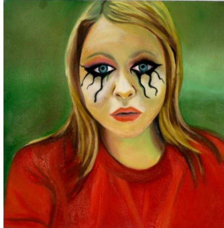
"Don't cry black tears" self-portrait,