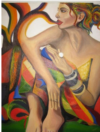
"Isadora" Acrylic on canvas