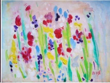
"Wet Flowers" 11x14 oil on canvas